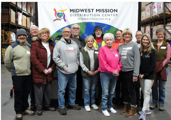
Our Saviour's UMC Schaumburg, IL