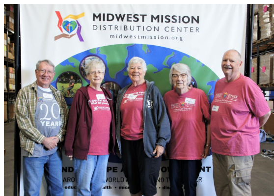
Union Reunion St. Louis, MO