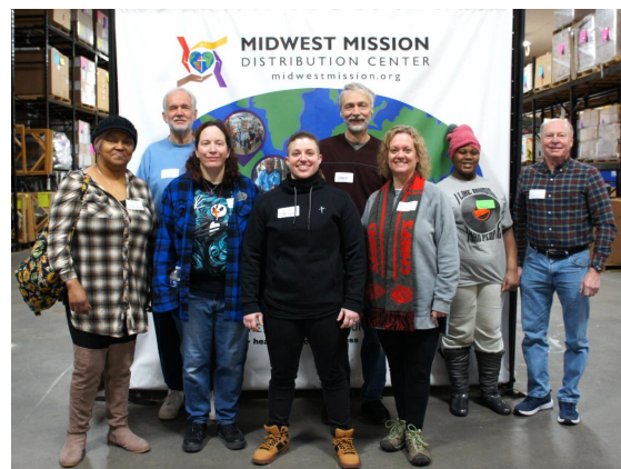
Wellspring UMC Oswego, IL