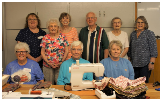
Sewing Group First UMC Springfield, IL