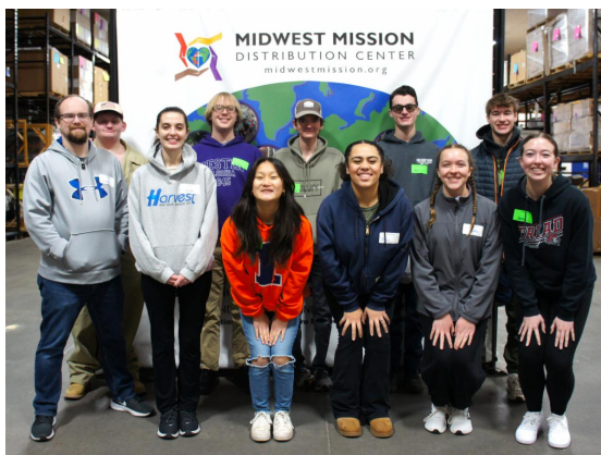
Troy MC Youth Troy, IL