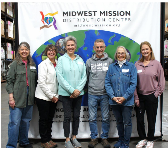
Simpson Group Springfield, IL