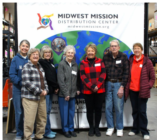
Taylorville UMC Taylorville, IL