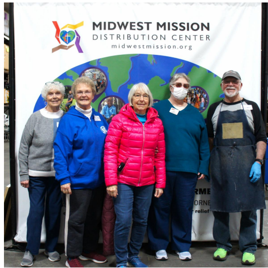
Grace UMC Jacksonville, IL