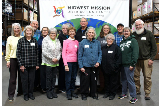
Monticello UMC Monticello, IL